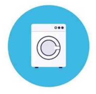
Wash reusable masks after each use. If the mask is disposable, discard it when visibly soiled or damaged.