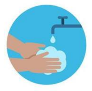
Wash your hands before and after touching the mask.

Wearing a face mask in public helps prevent the spread of COVID-19 — but only if worn properly, covering both your nose and mouth. Read mask-wearing tips to get the maximum protection for yourself and others.